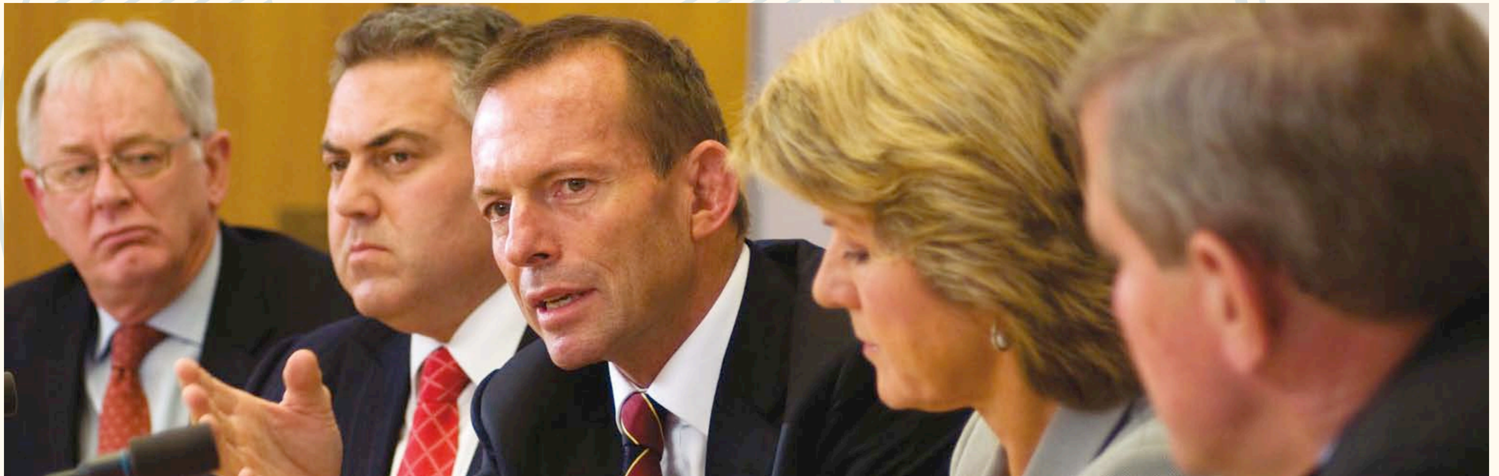
TONY ABBOTT AND THE COALITION TEAM HAVE A STRONG TRACK RECORD OF GETTING THINGS DONE IN GOVERNMENT.